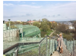
The university and library roof garden