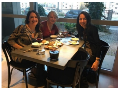
Eating well in Warsaw old Town